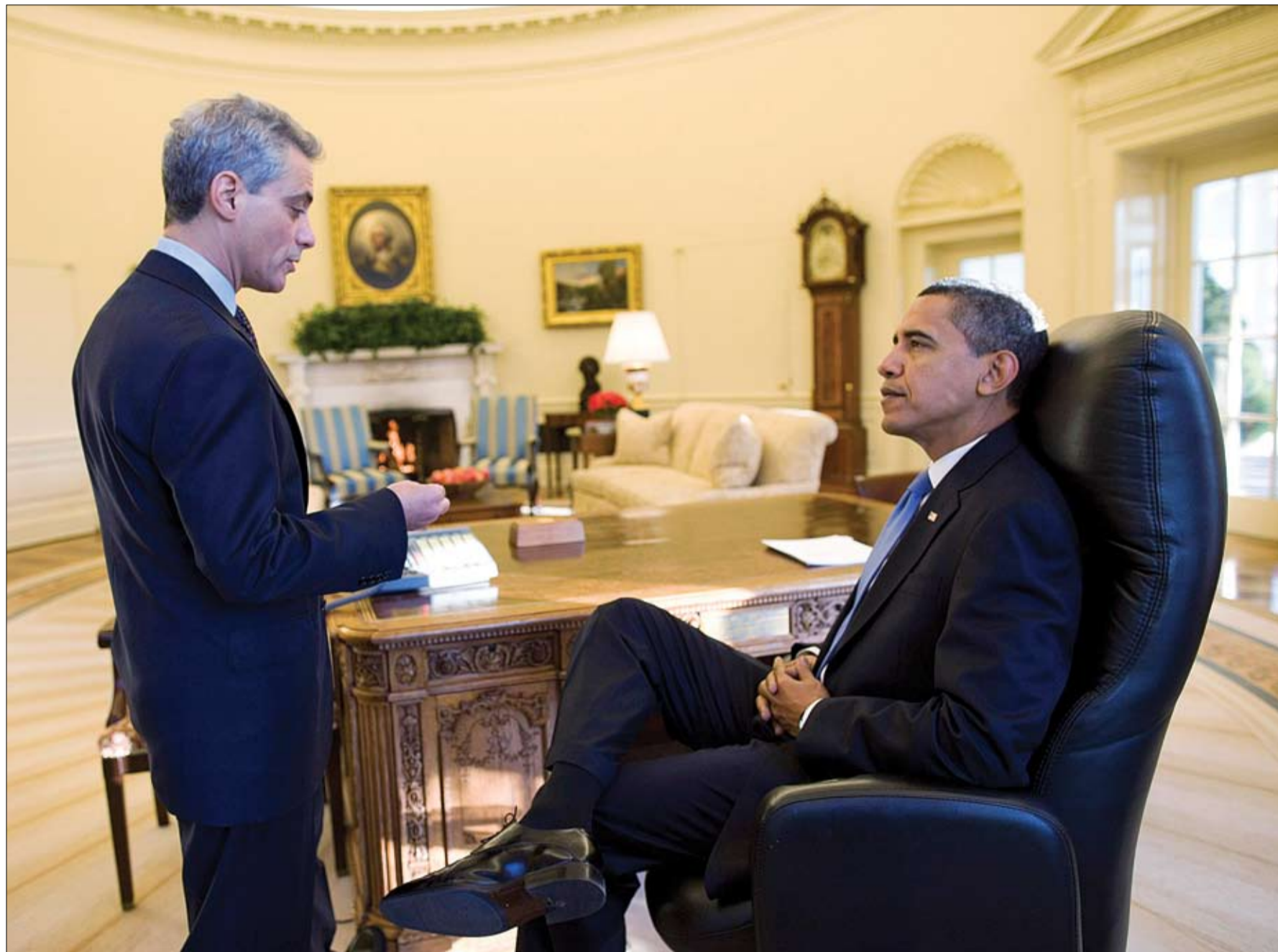
U.S. President Barack Obama talks with White House Chief of Staff, Rahm Emanuel, in the Oval Office.