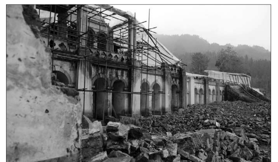
According to the National Wenchuan Earthquake Expert Committee, over 87,000 died in the May 12, 2008 earthquake centered in Wenchuan County of Sichuan Province.

The article went on to say, "It is said that the authorities are starting to investigate the rumors and will severely punish rumormongers."