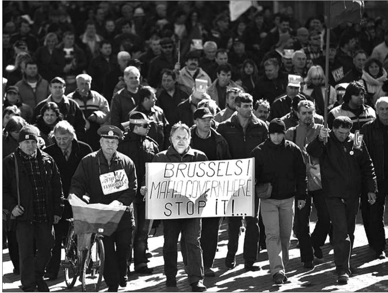
Bulgarian steel workers shout slogans and hold placards as they protest in the center of Sofia on March 9, 2009.

France Up to 2.5 million people demonstrated around France on Jan. 29 over pay and job protection. On March 5, unions and authorities signed a deal to end a six-week