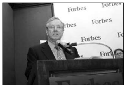
LOSS AND GAIN: Steve Forbes announces the Forbes' 2009 list of the World's Billionaires in Manhattan on Wednesday March 11.