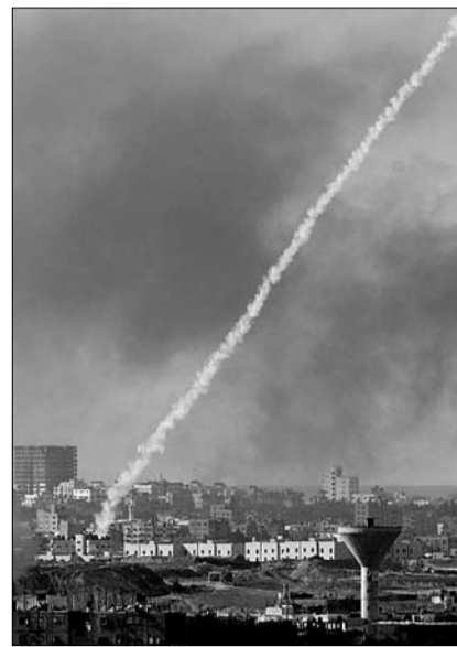
ROCKET FIRE: A picture shows a rocket being launched from the northern Gaza Strip towards Israel on January 14, 2009 as seen from the Israel-Gaza border.