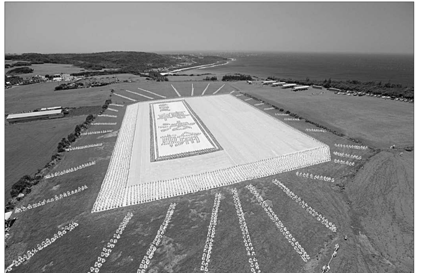
CELEBRATING: On the morning of May 9, over 6,000 Falun Gong practitioners gathered at the Puding Prairie in Kenting, Taiwan, and lined up to form an image of the book "Zhuang Falun," the basic text for Falun Gong.

In striving for freedom of belief, they have also brought to the Chinese people a revival of human morality and of hope for China. A group of ordinary people are