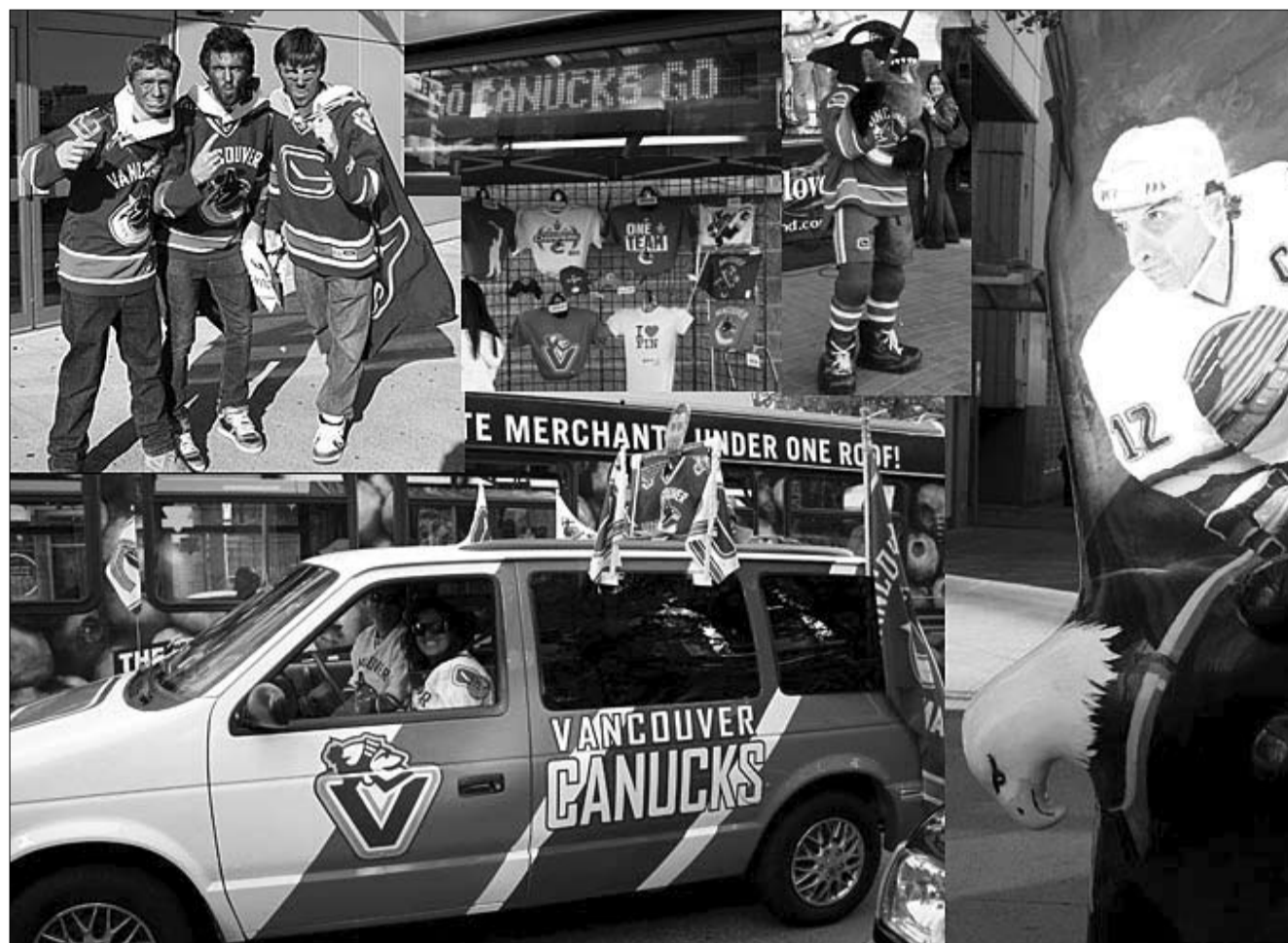
FORMS OF SUPPORT: A montage of fans showed support for the Vancouver Canucks during the NHL playoffs.