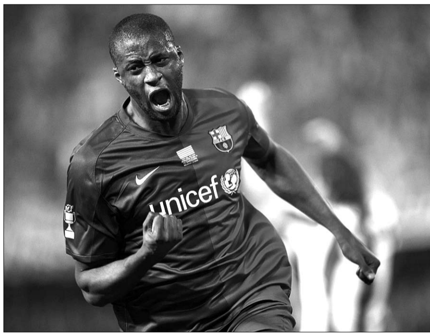
KING'S CUP CHAMP: Yaya Toure got the ball rolling for Barcelona with an incredible goal.

Athletic looked fresher, snapping at Barca all over the pitch, until Toure stepped up to level in spectacular fashion as he advanced out of defense.