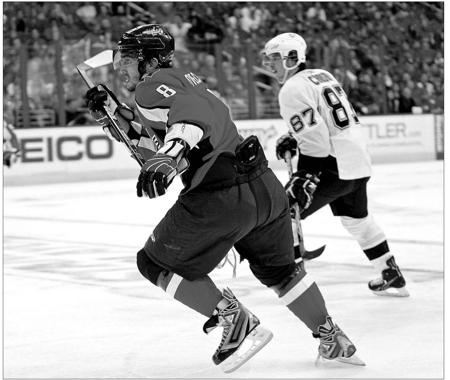
EAGERLY ANTICIPATED DUEL: Alex Ovechkin and Sidney Crosby recorded hat tricks in a highly entertaining Game 2 on Monday night.

regular season games, is among the top five in goals against average, save percentage, wins, and shutouts in the playoffs thus far.