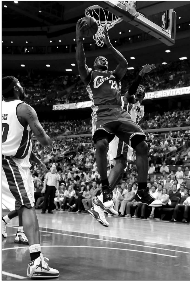
NBA MVP: LeBron James has brought a new level of excitement to the NBA along with his impressive stats.