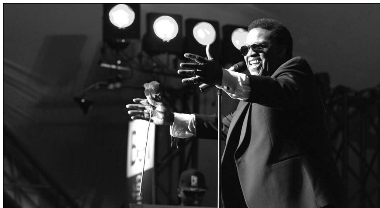
Al Green giving his love to the crowd at Ottawa's 2009 Jazz Festival

Slide shows illustrate Alesund before, during, and after the 1904 fire, and the museum invites you to walk through the living and working spaces of the family that created the building. The museum also houses a café and gift shop, and walking tours of the town are offered during the summer.