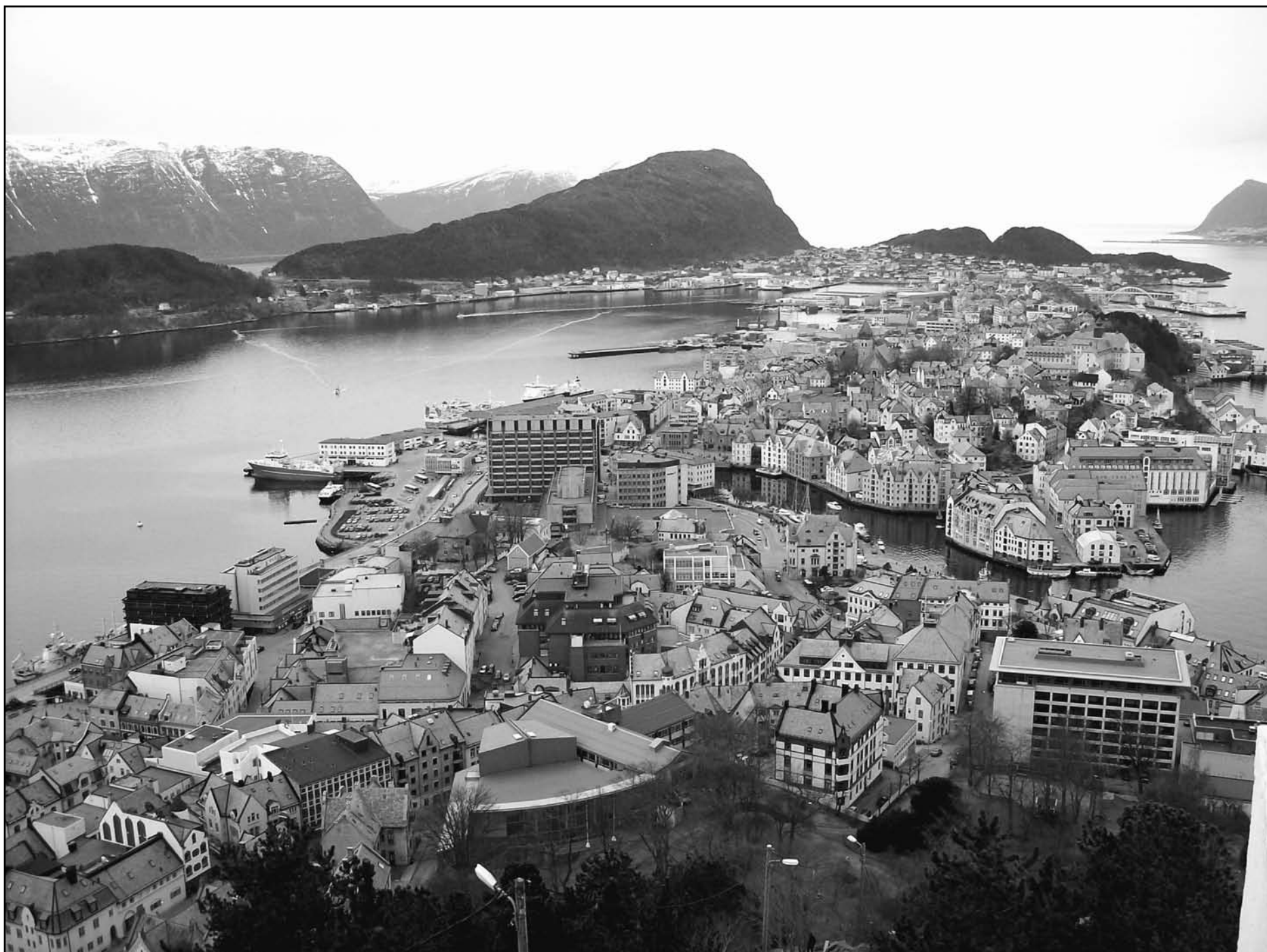
NORDIC DETAIL: No building is like any other in Alesund, where designs and patterns from Norse myth and legend predominate.

Incorporating motifs taken from Norse mythology and Viking history, the buildings drew their inspira-