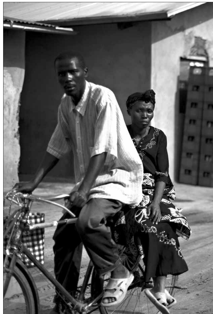
Rwandan refugees at the Nakivale refugee camp in Uganda. World Bank President Robert Zoellick has pledged further development aid to Rwanda, lauding it as a country "on the move."

Kagame is a former rebel leader whose fighters invaded to stop Rwanda's genocide. He has won praise for running a disciplined administration