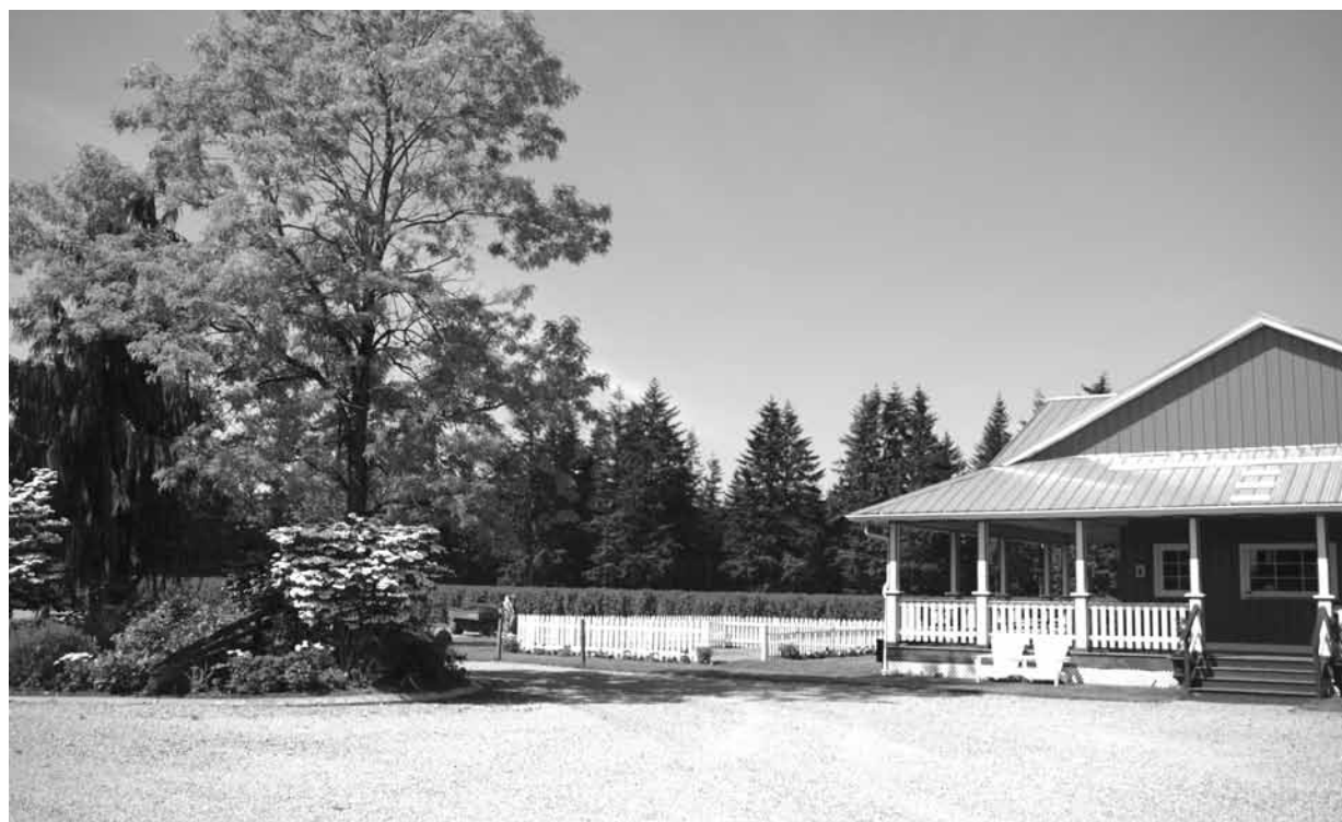
View of the restaurant and gift house at Krause Berry Farms.

market which is chock-full of original gifts for the home and garden