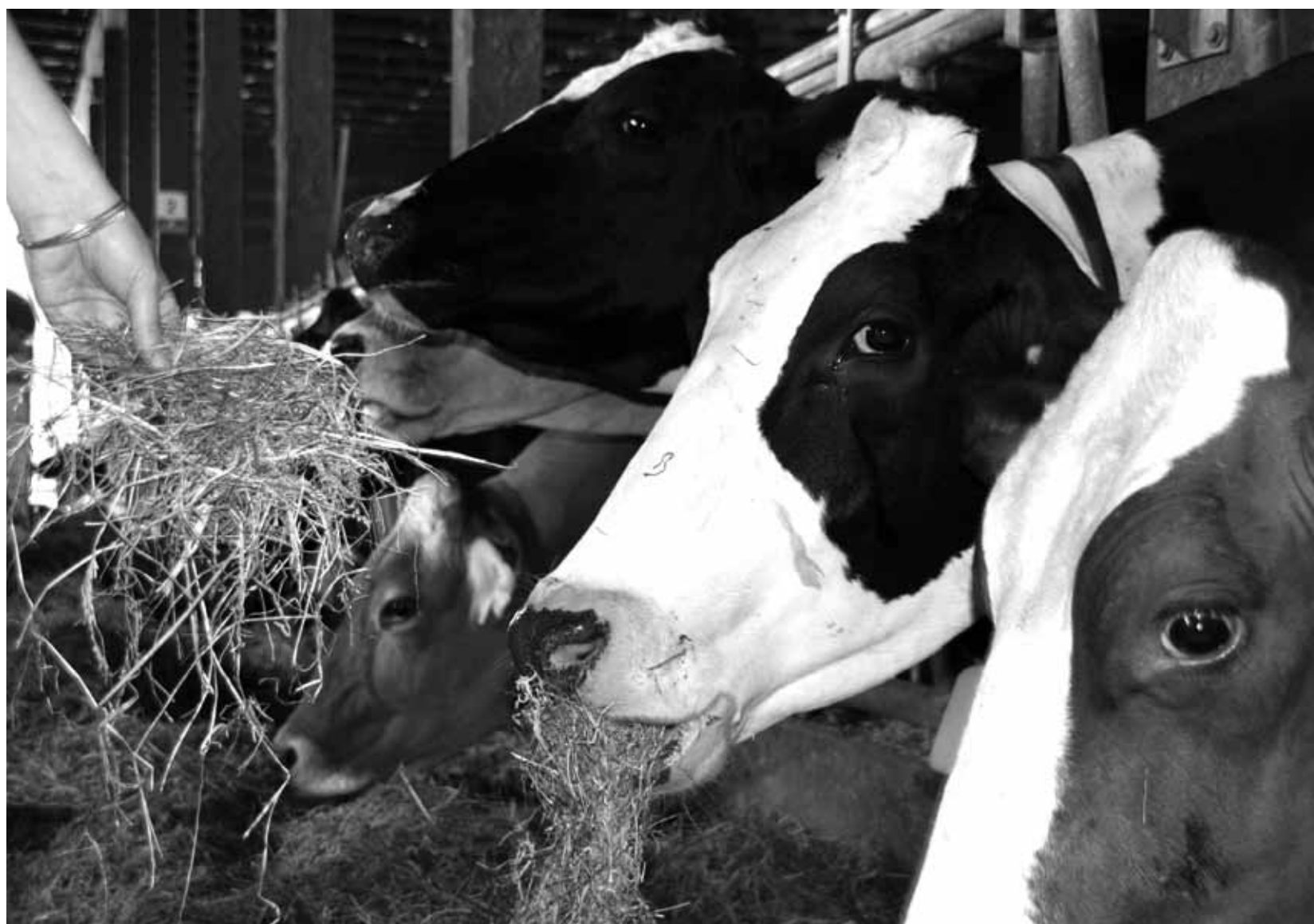
Happy cows at Aldor Acres Dairy Centre.

Krause Berry Farms, also in Langley, offers shortcakes, pies, cakes and roasted corn pizza, all made in the farm kitchen from quality ingredients. There is also a restaurant and