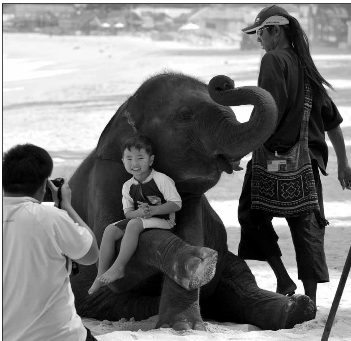
A young tourist is photographed while sitting on a three-year-old elephant named Lilly at a beach resort in Phuket on July 20, 2009. Phuket has fully recovered from the tsunami that killed around 5,000 tourists and Thais but the country's tourism industry is now being affected by the global economic downturn.

"While there are some signs of the situation gradually recovering