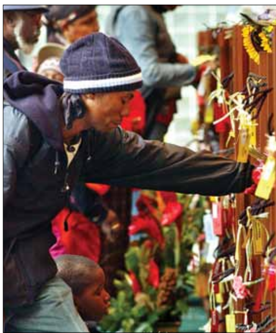
A man touches one of the hand-carved caskets at the African Burial Ground in New York City.