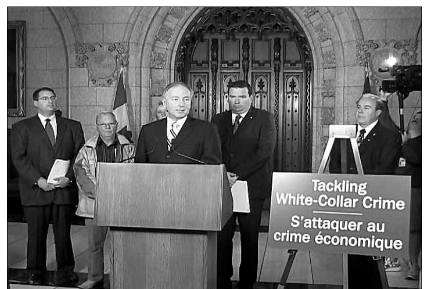
FIGHTING FRAUD: Minister of Justice and Attorney General of Canada Rob Nicholson speaking to the press on Parliament Hill Sept. 15 about the government's intention to introduce legislation to combat white-collar crime. To his right is Minister of Public Works and Government Services Christian Paradis. Further to the right is Parliamentary Secretary to the Minister of Justice, M.P. Daniel Petit.

Among them was a committee representing some 150 victims