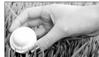
ODDBALL: The egg-shaped lip balm from EOS—both functional and whimsical.

"I grew up in the world of cosmetics and watched a lot of my colleagues stick their faces in pots of