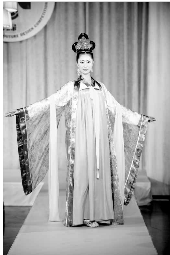
BRONZE WINNER: Meiyun Tsai's bronze-winning piece.