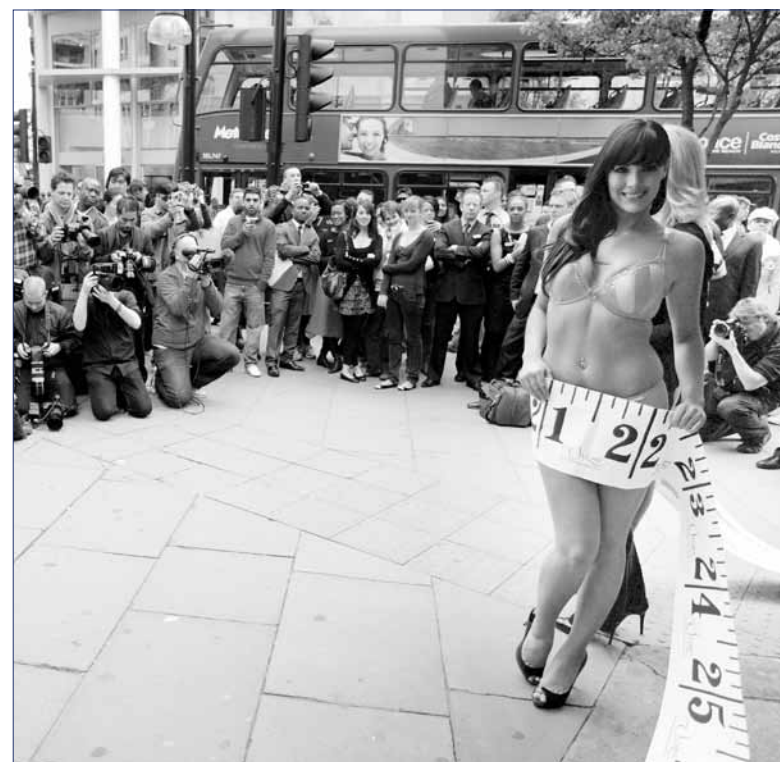
THE RIGHT FIT: The start of Ultimo's Bra Fit Clinic outside Debenhams department store, central London on April 28. The clinic aims at highlighting the importance of correctly fitting bras.

Full: For larger bustlines with little or no additional flesh, look for styles with