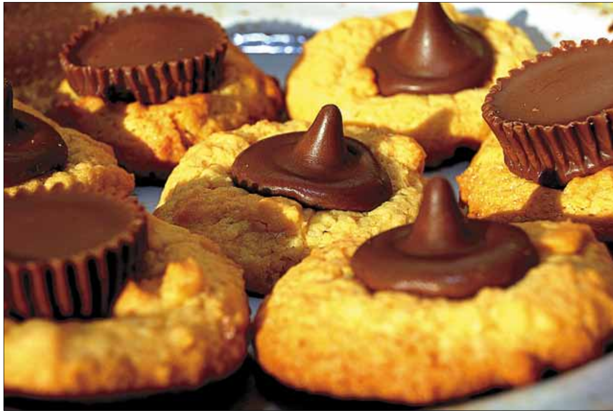
BAD FAT: Industrially produced trans fat can be found in a wide range of products, including margarines, donuts, French fries, cookies, and taco shells. THE EPOCH TIMES

"The problem with the regulation is that it's going to force thousands of British Columbia food service operators to eliminate