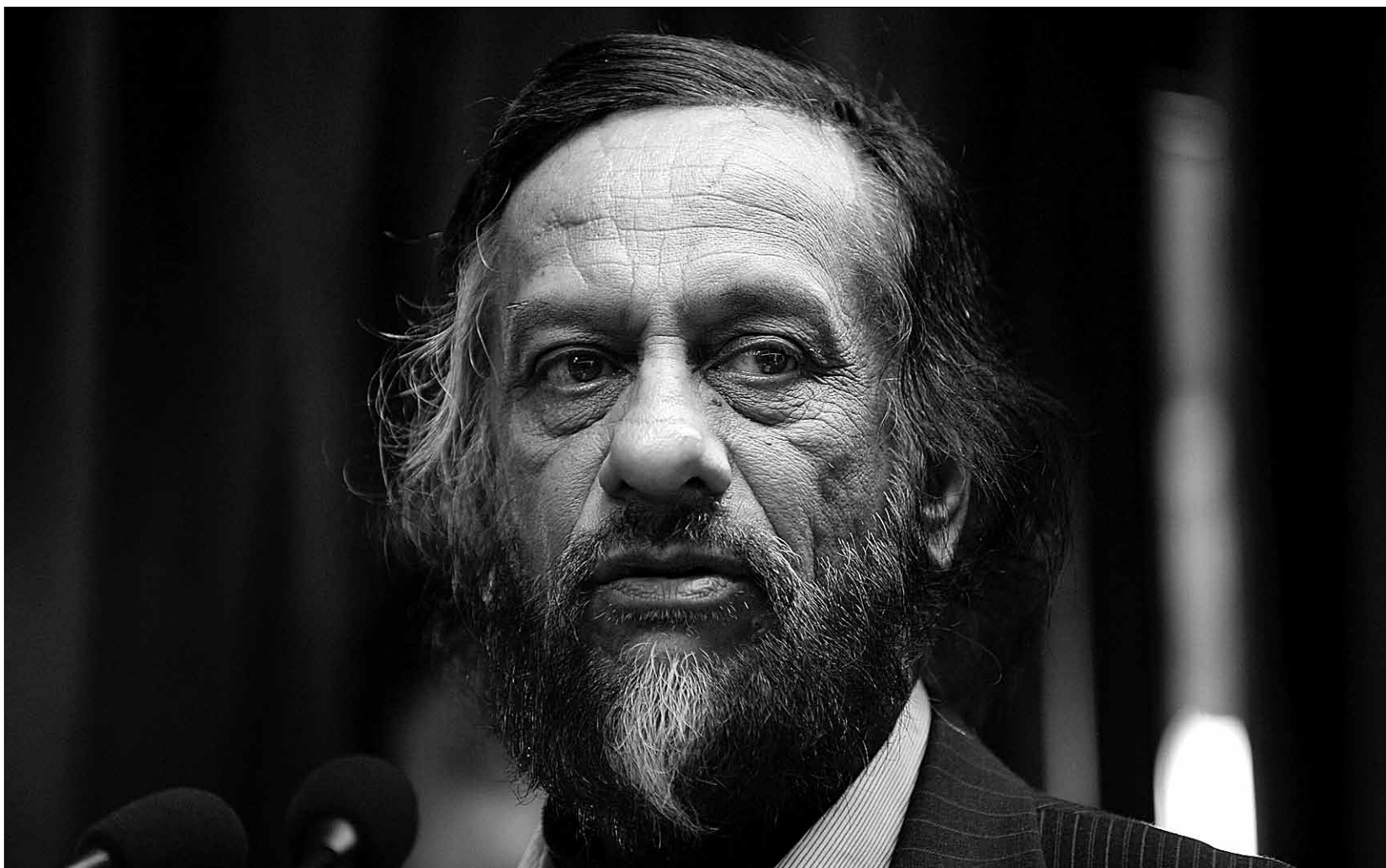
IPCC chair Rajendra Pachauri at a press conference in New Delhi on January 23. Pachauri told reporters that a doomsday prediction about the fate of Himalayan glaciers was 'a regrettable error.'

"Myself and others predicted this would happen and that's why we worked to get rid of [it] 10 years ago," he told CBC News. "If you're going to play around with [genetically modified] crops, once the genie's out of the bottle, once it's in the environment, you can't control it."