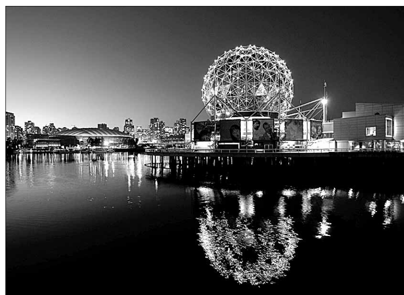
The TELUS World of Science geodesic dome in Vancouver.

"For so many years they've been stonewalling on allowing the real data to get through to the researchers who want to cross-examine it, and one of the things about Climatigate is that they're finding that some of the data that was requested through access to information in the United Kingdom has actually been destroyed rather than given to the skeptical scientists, and that's against the law,"