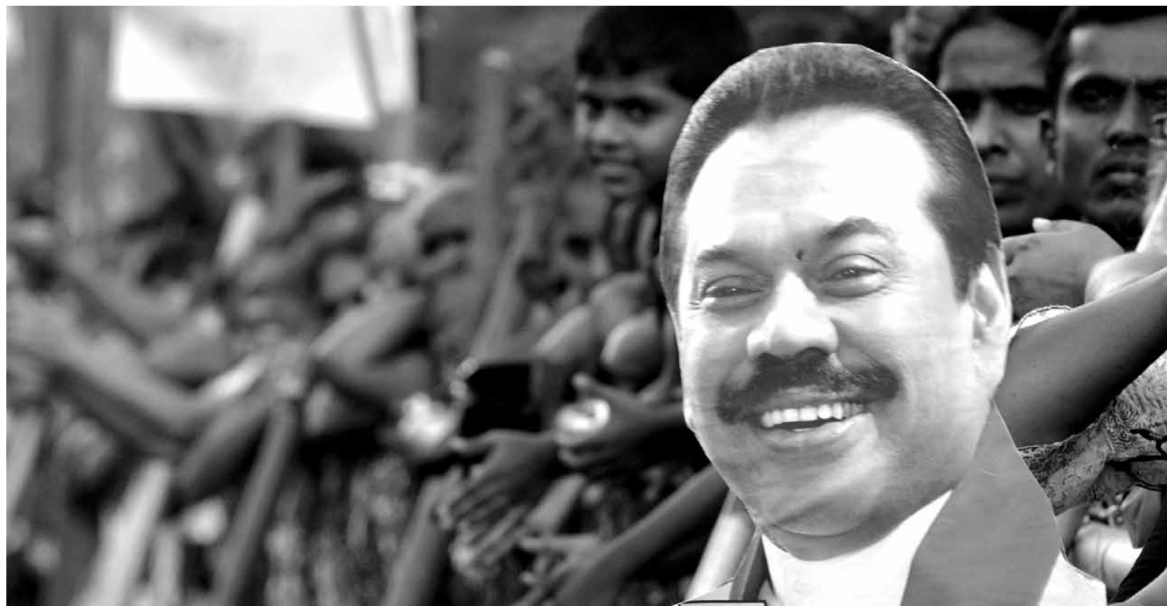
Supporters of Sri Lankan President Mahinda Rajapaksa cheer him in Colombo on January 27, 2010 after he was declared duly elected by the Elections Commissioner. Rajapaksa won a second term, defeating former army chief Sarath Fonseka with 57.9 percent of the popular vote.