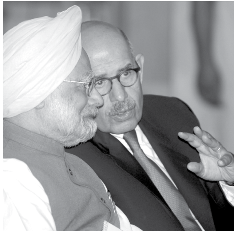
NUCLEAR ELITE: The former director of the International Atomic Energy Agency Mohamed ElBaradei (R) gestures as he speaks with Indian Prime Minister Manmohan Singh in New Delhi.

Not only does this statement depart from India's historic NPT opposition, but it also could agitate nuclear diplomacy in 2010. India's willingness to join the NPT contains the potential to strengthen the NPT, which places a premium on how existing NPT members respond to India's policy shift. Bringing India within the NPT as a NWS would be controversial, but to exclude a nuclear-armed but non-proliferating India when it is now willing to join would not strengthen efforts against nuclear proliferation.