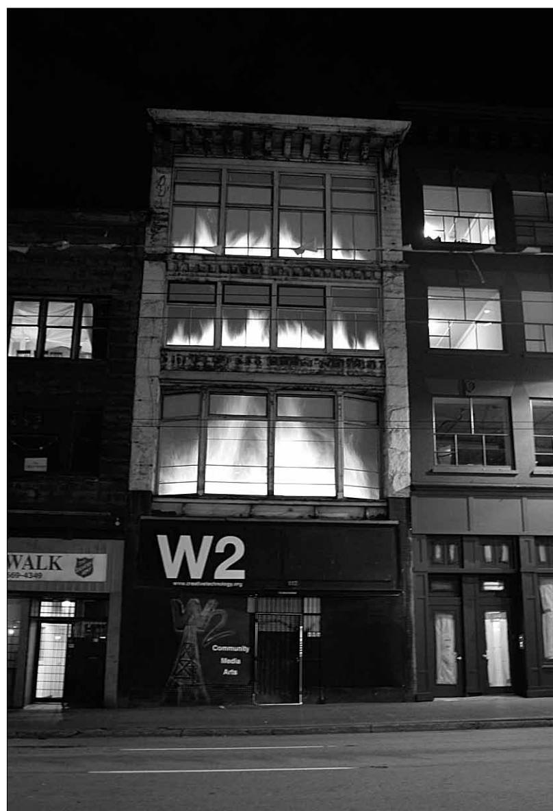
The W2 Culture + Media House provides a space and the tools for unaccredited media to cover the 2010 Vancouver Olympics.

"We have been looking at this moment in history between Beijing, where the government limited social media, and when we're going to London 2012, and likely the operations will be monetized and commercialized. So Vancouver