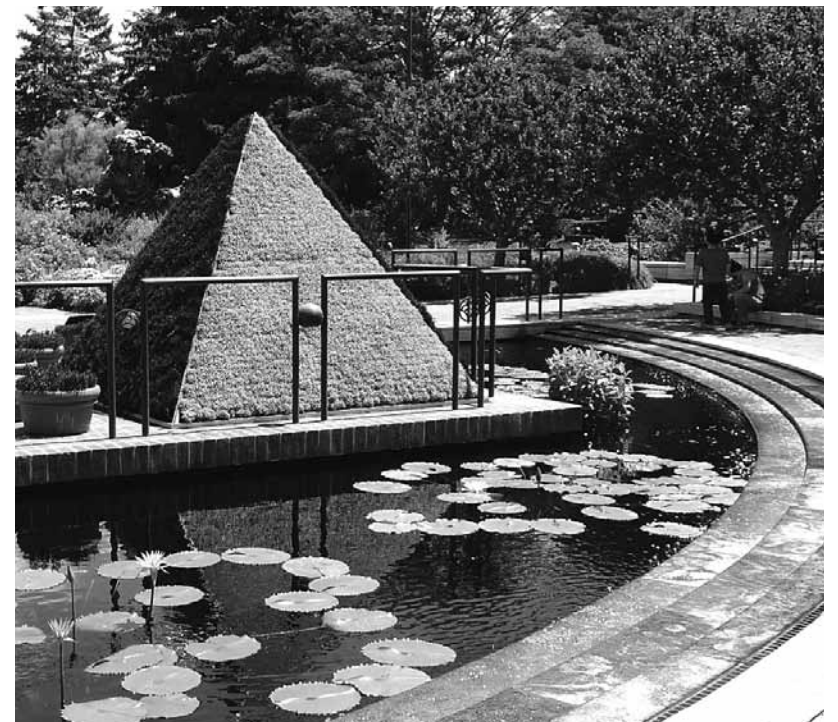
CHICAGO MAKES THE 'LIST': The Heritage Garden at the 400-acre Chicago Botanic Gardens displays plants arranged by origin. The pyramid has sides covered in red and green Joseph's Coat, watered by a filtration system running in pipes through the structure.

What is your 2010 travel resolution? Share the adventure with us! Write to: submissions@epochtimes.com Attn: Travel