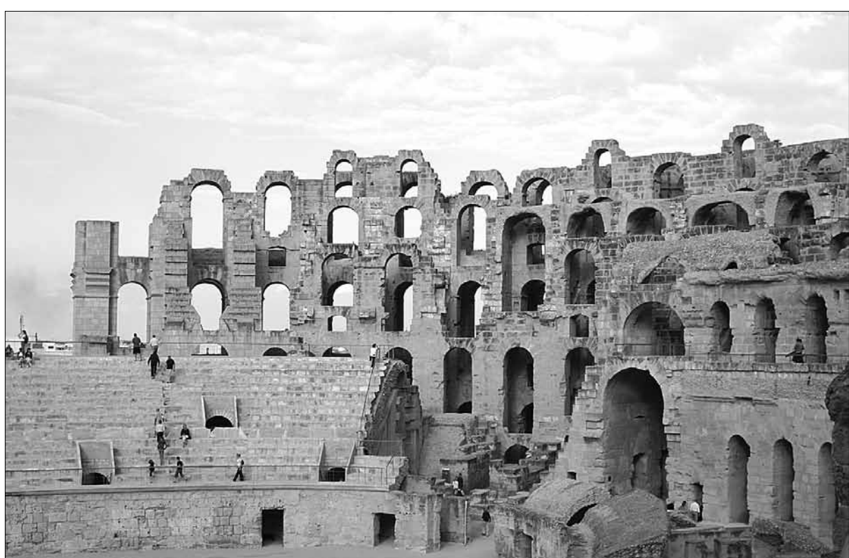
EL JEM GEM: The amphitheater of El Jem in Tunisia is considered the third largest such historical vestige of the Roman Empire.

FRIENDLY BORDER: Canadian provinces and American border states. British Columbia—Idaho; Ontario—Michigan; Quebec—Vermont; Saskatchewan—North Dakota (Massachusetts, Oregon, and Wisconsin do not have land borders with Canada.)