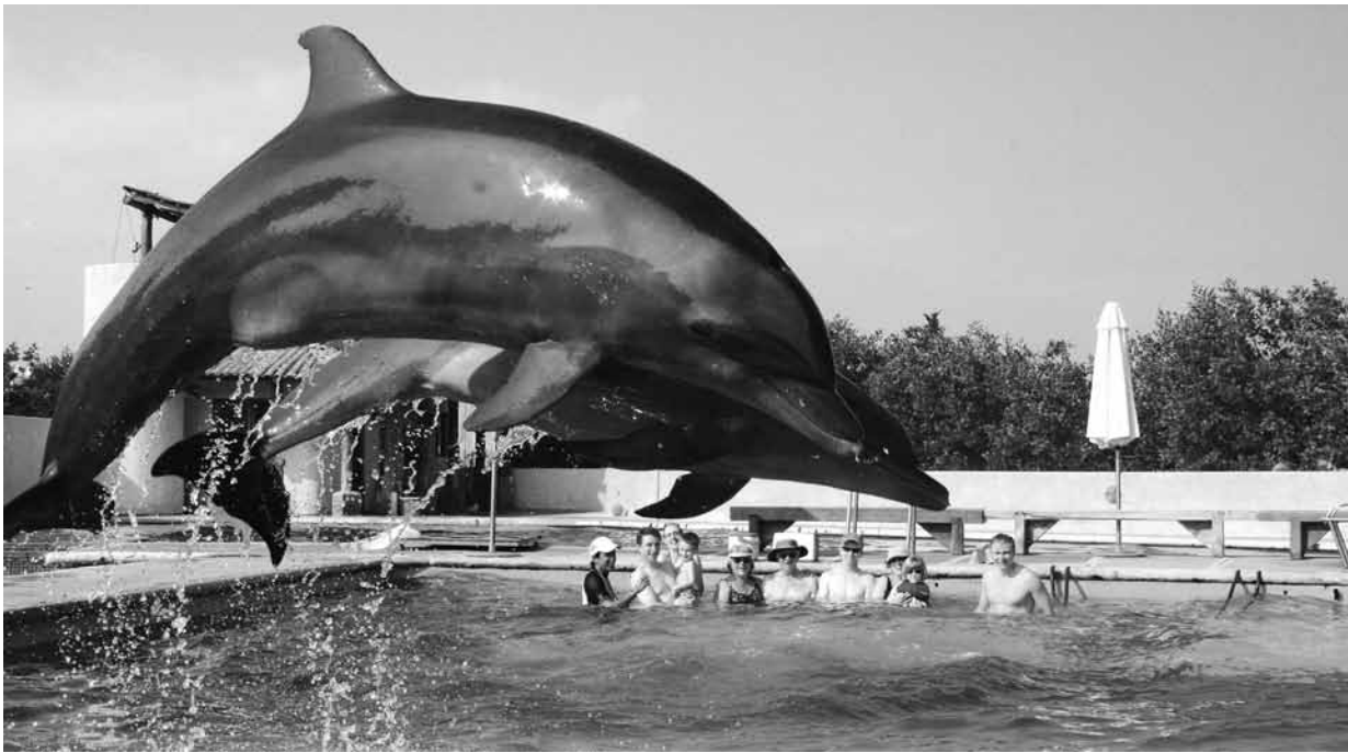
LEARNING EXPERIENCE: You can be a dolphin trainer for a day and learn about the care and training of dolphins at Vallarta Adventures in Riviera Nayarit. MARK SISSONS