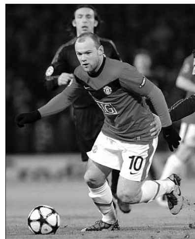
WAYNE'S WORLD: Wayne Rooney and Manchester United were too much for AC Milan to handle on Wednesday in Champions League.

best at the moment," said Beckham about Rooney in an interview with Sky Sports.