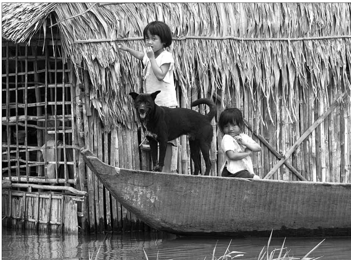
AT RISK: Two young girls take a boat out on their own in Long An Province, in South Vietnam. Every year, up to 350,000 children drown in Asia. The Australian government is funding the establishment of the International Drowning Research Center aimed at reducing child drowning in Asia.

is the adults' fatalistic view of the issue, says Scarr.