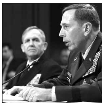
U.S. Army Gen. David Petraeus (R), commander of the U.S. Central Command, and US Navy Adm. Eric Olson, commander of the U.S. Special Operations Command.