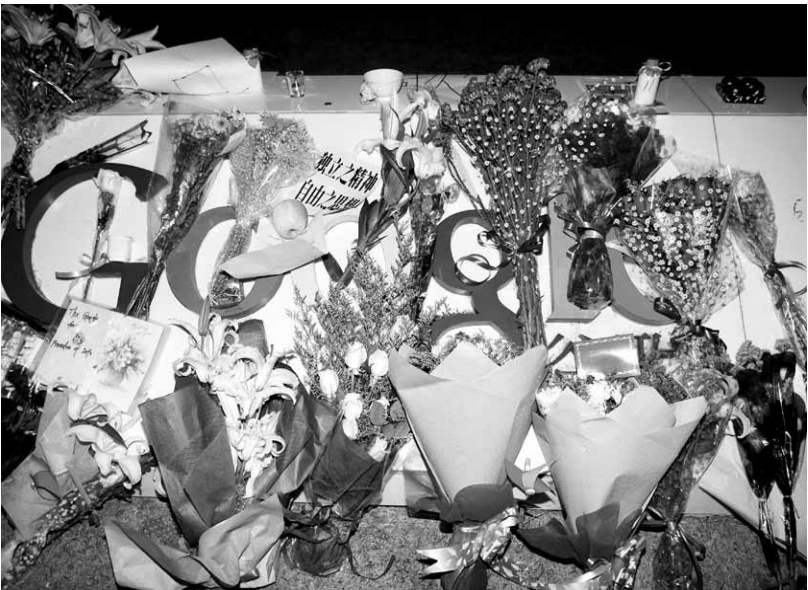
THANKS: The Epoch Times News Group joins the people of China in thanking Google for ending its censorship of search results. A card, a letter, and flowers were placed on the Google logo at its China headquarters building on March 23 in Beijing, China.

ward greater freedom of information cannot be reversed; nor can it be stopped. The Chinese netizens, independent media such as The Epoch Times, and international society will say no to the CCP's attempts to do so. More than 2,000 years ago, Confucius said: "A man of noble character remains composed and continues to follow principles even in a difficult situation; a villain, on the contrary, becomes flustered and would commit all kinds of wrongdoing." Even when suffering the loss of money and harm to one's practical interests, one must uphold principles. Freedom is not free. In the fight for freedom, there is a cost to pay. People will praise as pioneers those who are willing to pay that cost. If Google, with its technological prowess, dedicates itself to the great undertaking of Internet freedom, it will blaze a new trail for Internet freedom. On behalf of staff of the Epoch Times News Group and our readers, we wel-