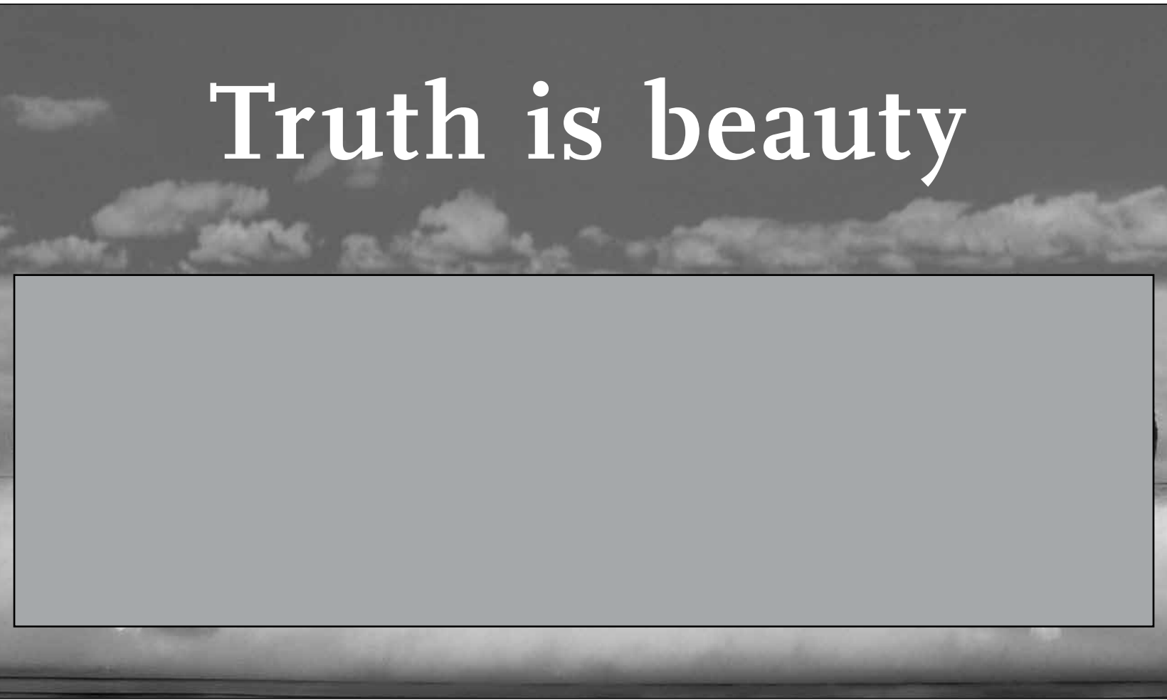
GRACE AND BEAUTY: Shen Yun performers capture the richness and diversity of China's ancient heritage. SHEN YUN PERFORMING ARTS

Chinese people have announced their intentions to quit the Chinese Communist Party and its affiliated organizations on a special Web site established by The Epoch Times. Many others, unable to break through the Chinese Internet blockade, have posted their withdrawal statements on poles or buildings. Others have written them on Chinese currency. Read recent statements of Chinese quitting the Party, the latest news on the "Nine Commentaries," and more at http://www.NineCommentaries.com .