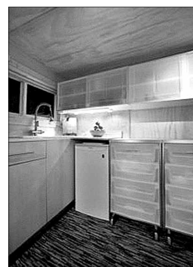
The Twelve Cubed kitchen. JAMES STUART