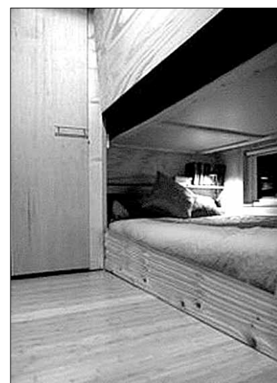
The Twelve Cubed bedroom. JAMES STUART

The Twelve Cubed is priced at $24,500, making it far cheaper