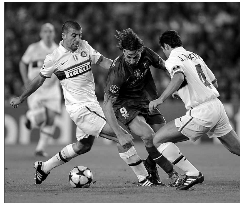
BENDS BUT DOESN'T BREAK: Inter Milan defenders closed down the best of Barcelona's attacks on Wednesday.

Inter joins Bayern Munich, who crushed Lyon 4-0 in aggregate, in the Champions League final, which will be played in Madrid on Saturday May 22.