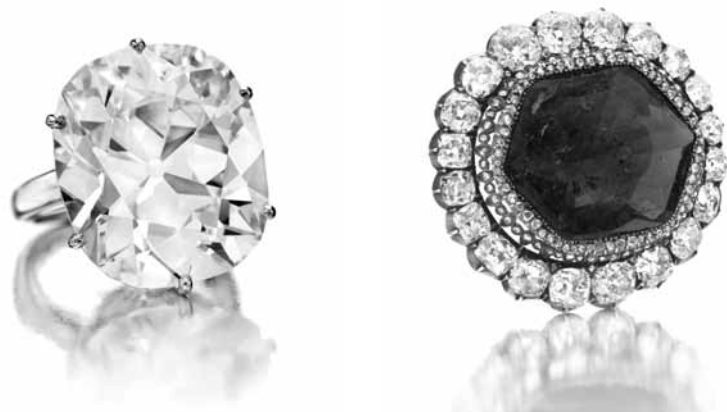
Catherine II of Russia was known as one of the greatest jewelry collectors of all time. She owned the famous emerald and diamond brooch around the 1770's.

The Emperor Maximilian Diamond weighing 39.55 carats