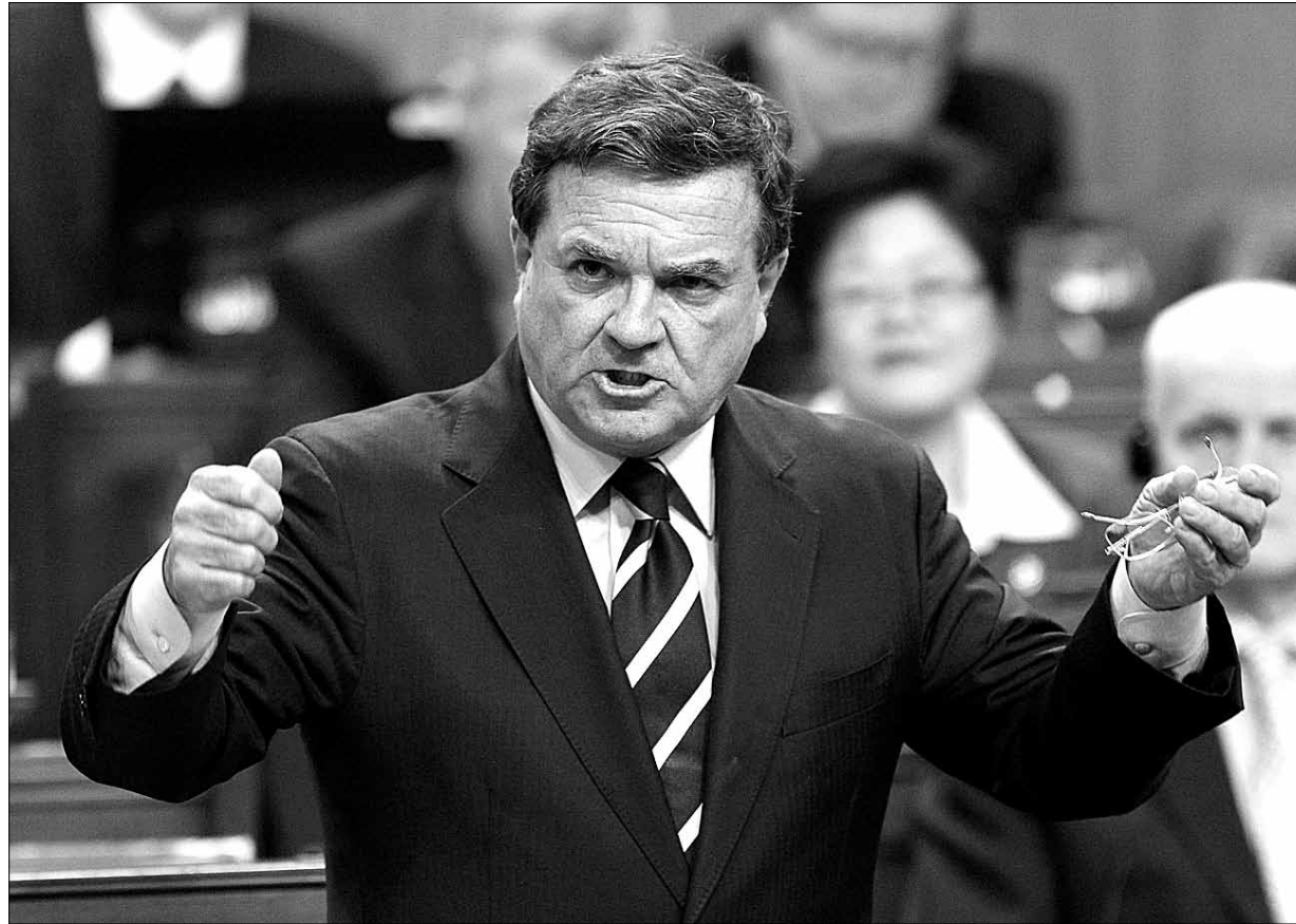
Finance Minister Jim Flaherty announced legislation for a new national securities regulator in Ottawa on May 26, 2010.

"Over the years, it seems that almost every generation has taken up the idea," he said, adding that experts, international organizations, and others have supported it as an