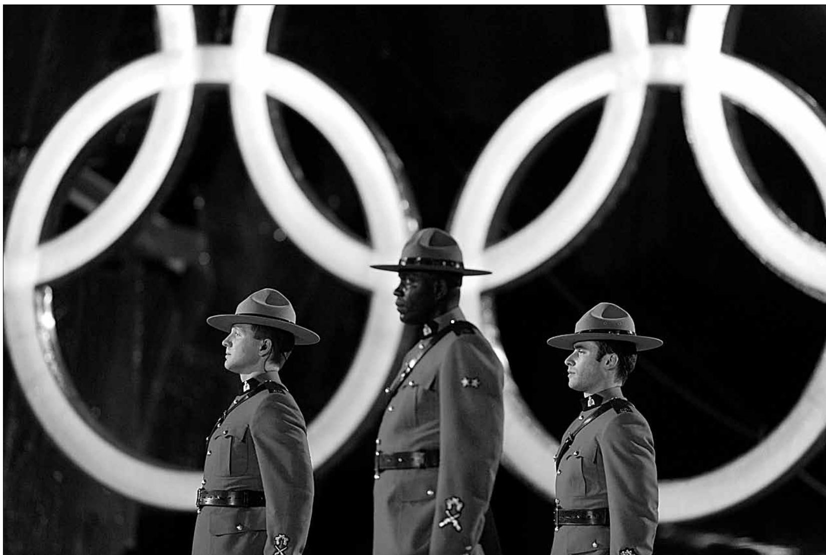
Mounties stand next to Olympic rings during the closing ceremony of the 2010 Winter Games in Vancouver. Violations of free expression during the Olympics was one of the topics covered in a new report by Canadian Journalists for Free Expression.

Supreme Court rulings score an A while access to information gets an F