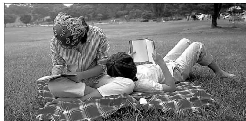
WRITE IT DOWN: Journaling can be a good way to slow down and be present with what's going on for you.