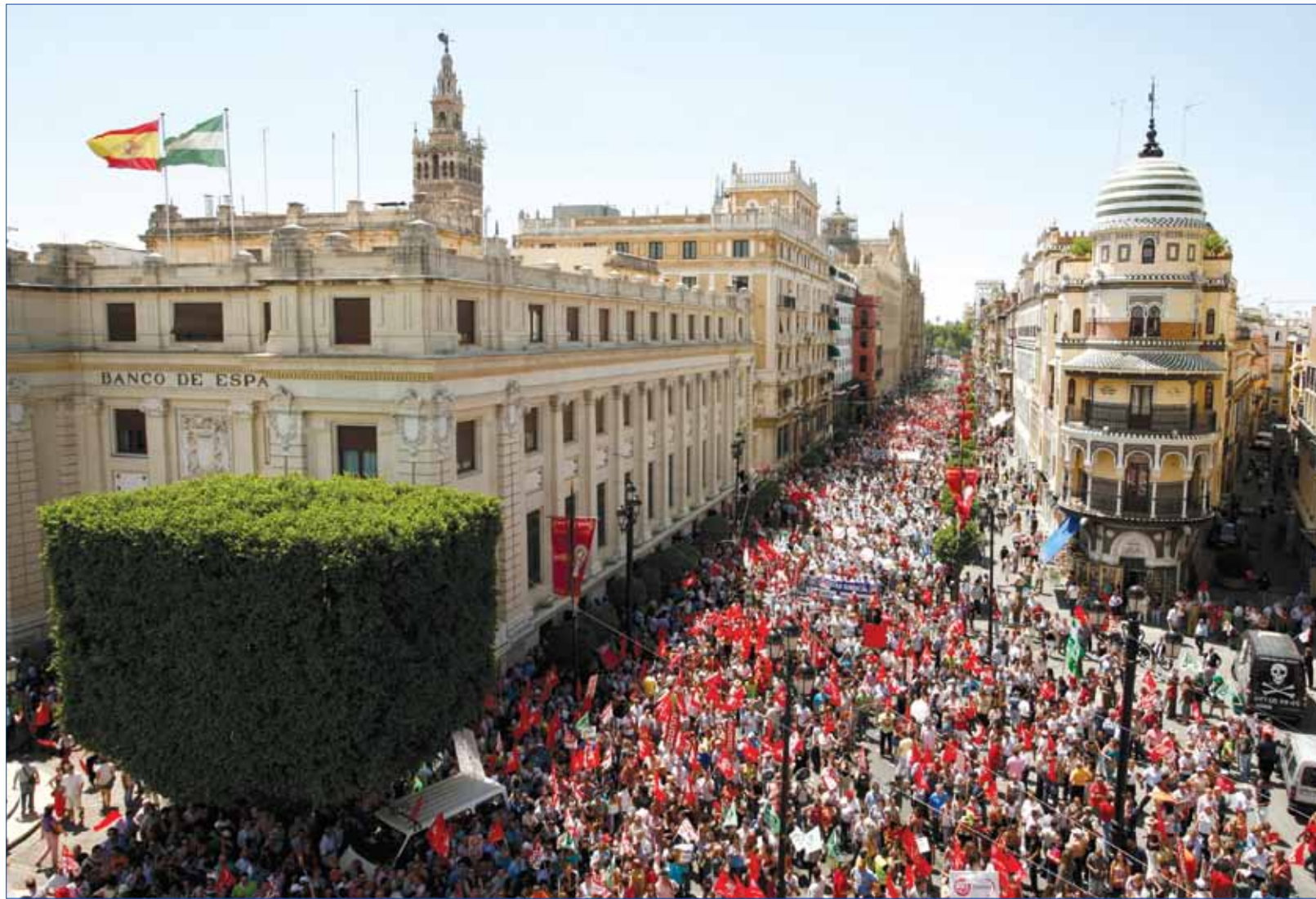
Public sector workers march during a general strike called by the public sector in Seville, Spain, June 8, 2010. Spain's unions plan to join others in what could become a large EU general strike on Sept. 29 as several labour groups protest austerity measures EU governments have taken to rein in spending and pay off dangerously high deficits.