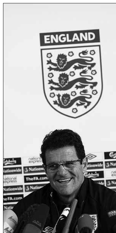
CAPELLO CHOOSES: England's Italian manager Fabio Capello went for experience over speed by leaving out Theo Walcott.

Forwards: Peter Crouch, Jermain Defoe, Emile Heskey, Wayne Rooney