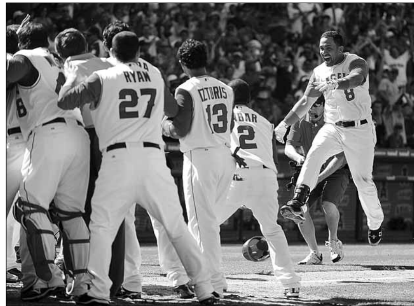
BE CAREFUL: Kendry Morales (right) landed awkwardly in his game-winning home run celebration, breaking his leg.

The New York Yankees were not so lucky. In fact, they held a six-run lead over the Cleveland Indians and somehow managed to cough it up, the third time in the last two weeks that they have lost leads of five or more runs.