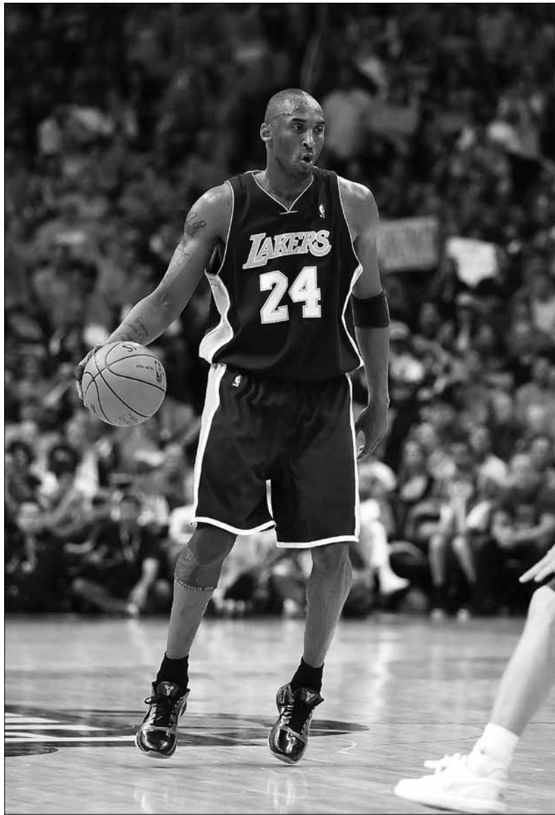
IMMORTALITY BECKONS: Los Angeles Lakers shooting guard Kobe Bryant seeks to avenge his team's loss to Boston in 2008.

In the past two years, Rondo has elevated his game to new heights. He can break down defenses by driving the lane and forcing them to collapse. Rondo has mastered the floater and if he could hit it over Dwight