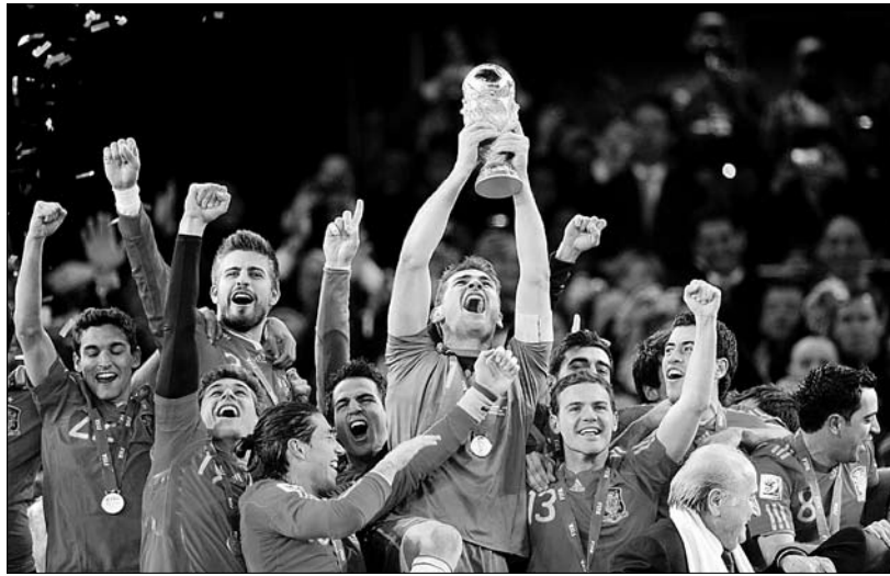
WE ARE THE CHAMPIONS: Spain's goalkeeper and captain Iker Casillas celebrates with the FIFA World Cup trophy and his teammates after a nervy victory over Netherlands last Sunday.

Nigel De Jong could have easily been sent off for a studs-to-the-chest foul on Xabi Alonso just before the half-hour mark.