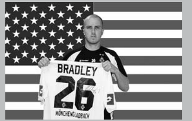
Borussia Monchengladbach jersey.