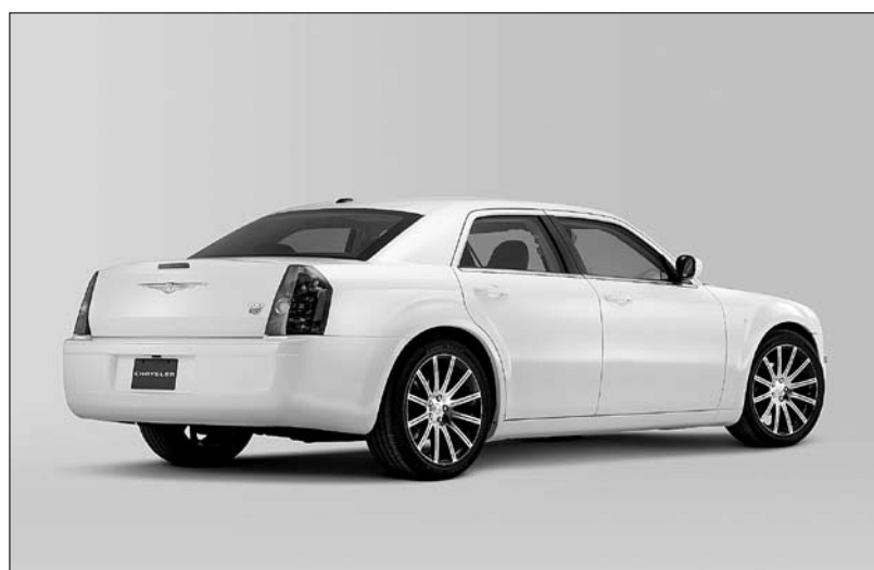
2010 Chrysler 300C Hemi

The 300C is spacious, with great headroom and legroom. Yet the cabin is made for extended comfort with the arrangement of interior features. The instrument cluster features an electronic vehicle information centre that can access