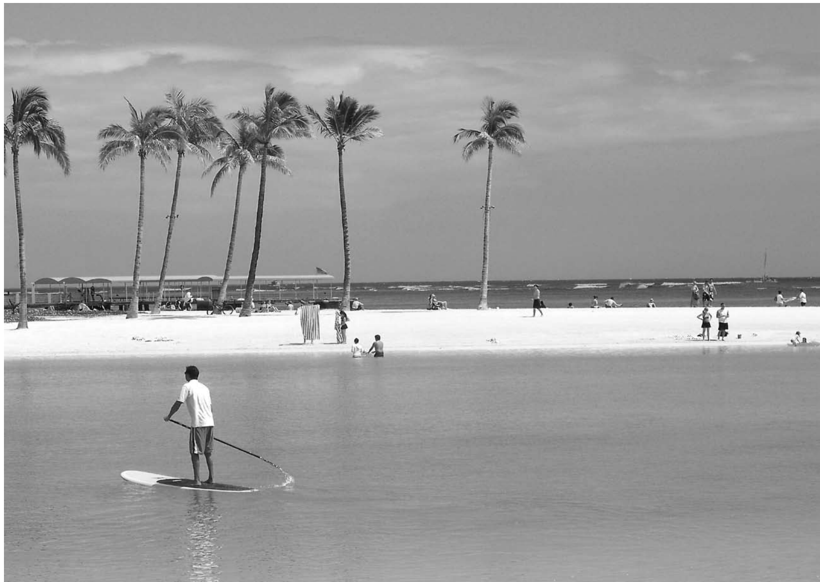
WATER FUN: Paddle surfing at the world-famous Waikiki Beach. ANNE PILLSBURY