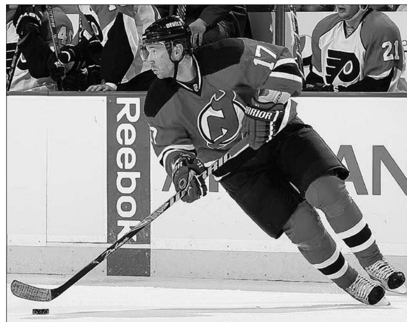
TOP FREE AGENT: The Ilya Kovalchuk free agency saga will drag on some more after the NHL rejected his 17-year contract.

It was obvious that the contract did not "make sense" and the NHL had to put an end to this type of ultra-lengthy contract designed to circumvent the salary cap. The NHL