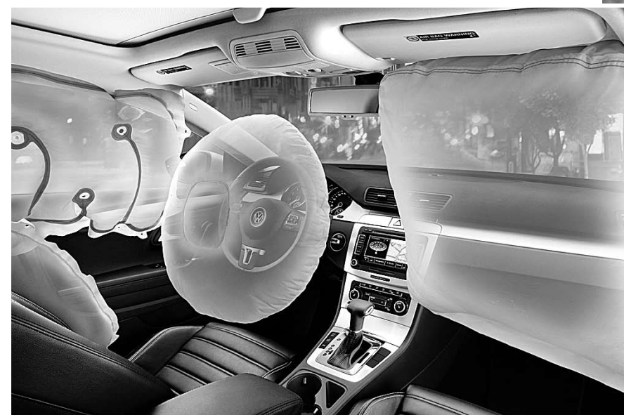
The interior of the CC Sport

Volkswagen was one of the auto companies that had vehicles represented at the Spring Challenge. I drove their Golf and was impressed by the European styling, quickness, and the way it glided down the narrowest of residential streets as well as the track. I drove the diesel model