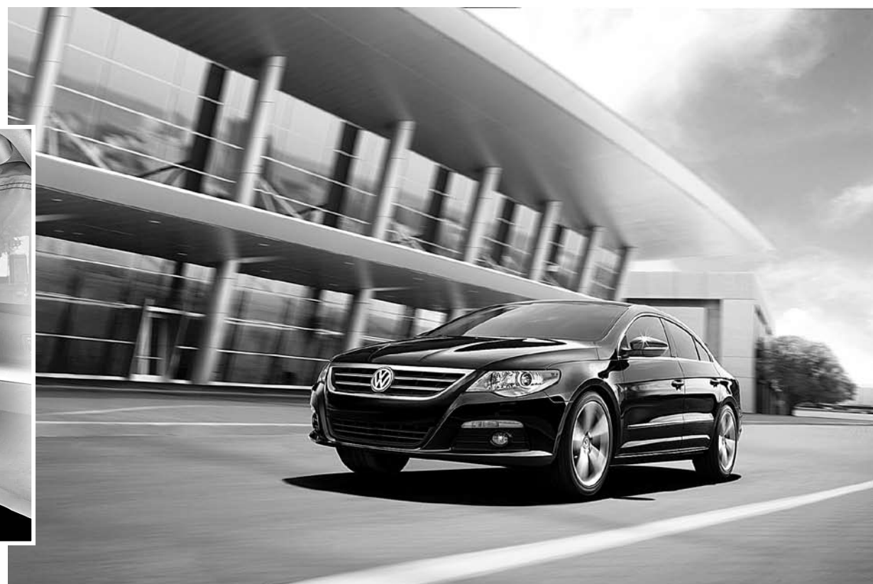
2010 Volkswagen CC Sport

Safety and dependability are keystone words in describing the CC Sport. Front and rear side-curtain protection head airbags, along with a driver and front passenger side-tho-