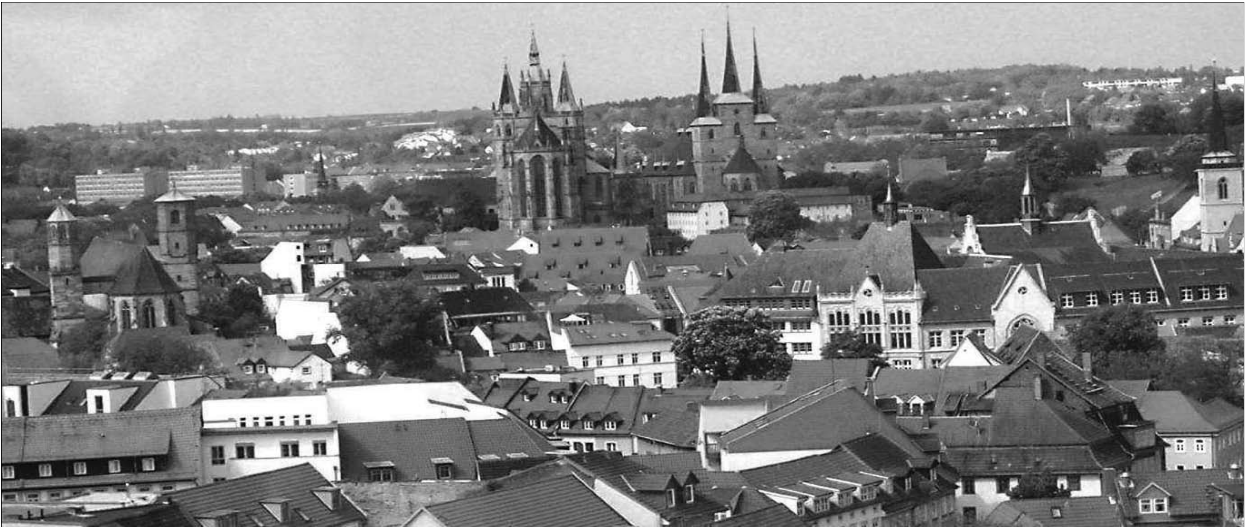
HIDDEN BEAUTY: The Thuringia region in Germany is a well-kept secret just waiting for the explorer to experience unique history, culture, art, and architecture.