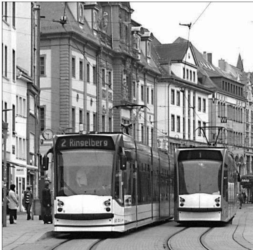
ERFURT EXCURSION: The tramway in Erfurt, Germany, takes visitors on a tour to the most exciting and most important places to visit in the city. TERRI HIRSCH

Our morning started at the Merchants Bridge, the longest medieval bridge in Europe, with a narrow cobblestone road that has 32 houses on both sides. While the top of the bridge still has families living in these houses, the bottom of the bridge has shops offering hand-painted ceramics, glassware, jewelry, woodcarving, and antiques.