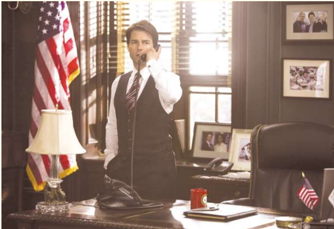
Tom Cruise gets serious