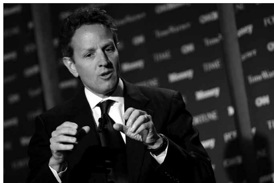
NEW RULES: U.S. Treasury Secretary Timothy Geithner participates in a question and answer session with Time Magazine managing editor Richard Stengel at the Time Warner Center on Monday in New York City.

The outline offered few new details on elements of the plan that were already known and side-