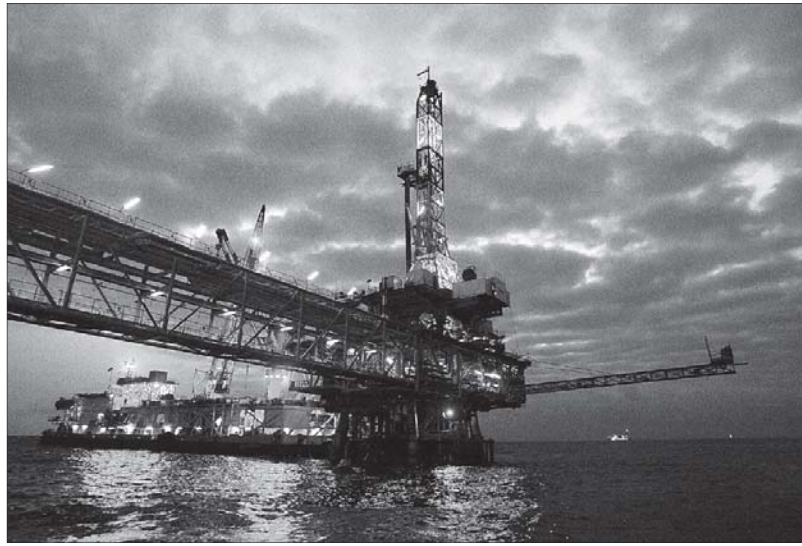
OFFSHORE: Unlike other oil-rich African nations, Angola's oil for the most part is safely located offshore.

continent are Angola and Sudan. It has extended over $5 billion in oil-backed loans and revolving credit lines to Angola. In 2007, for instance, China offered a $1.4 billion operating loan to Sonangol through the China Petroleum and Chemical Corporation. Since 2000, Chinese trade with Angola increased by 14-fold. China's policy of political non-interference—turning a blind eye to a country's human rights situation, for example—sets just the tone for a regime like the MPLA.